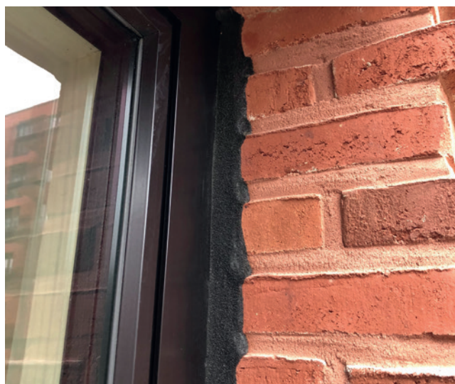
Installation example: ISO-BLOCO 600 „MAXIBOND“

Alternative dimensions available on request.