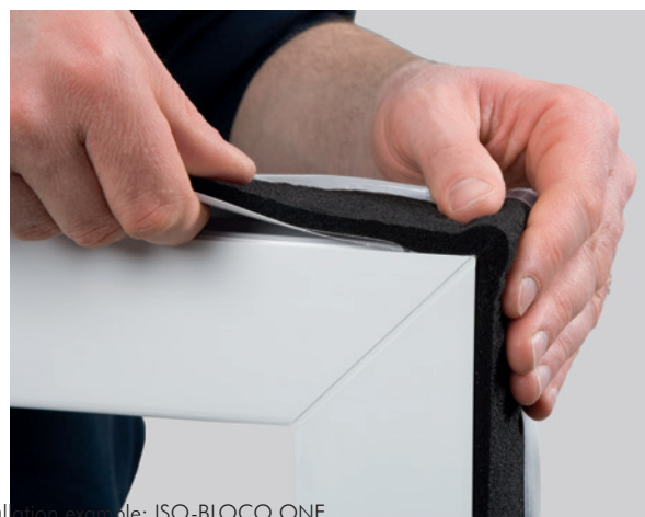
Installation example: ISO-BLOCO ONE

*** Movement in structural elements and temporary longitude changes are to be taken into account by the max. joint width.