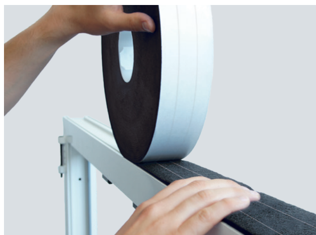
Installation example: ISO-BLOCO HYBRATEC

* Movement in structural elements and temporary longitude changes are to be taken into account by the max. joint width.