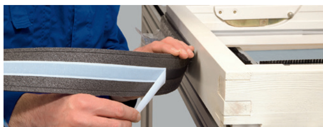
Installation example (1-BT): Fitting wooden windows